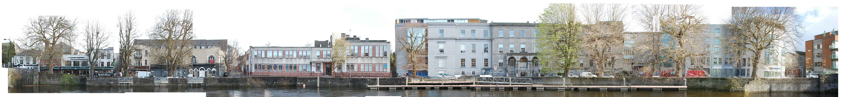
Existing Photographic Elevation